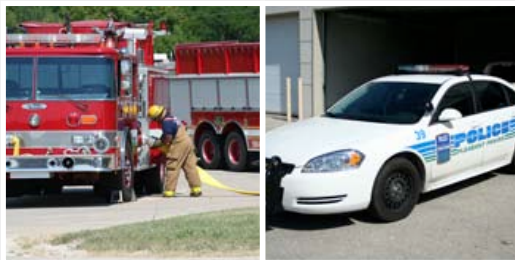
48% will be invested in public safety services, including police, fire and rescue

The majority of 2011 budget dollars (approximately 67%) will be used to provide public safety services, such as police, fire and rescue, and public works services, such as snow plowing, road maintenance, and similar work. The remaining amount (roughly 33%) will be used to: pay down existing debt, finance General Government's day-to-day operations, operate a Community Development Department, and maintain the Village parks. Percentages* for each area are shown below.