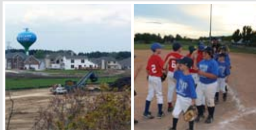
5% will be used for the Community Development Department and the Village parks system