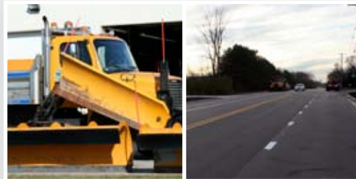
19% will be invested in public works services, such as snow plowing, road maintenance and the like