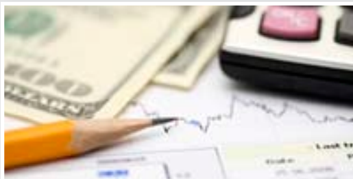
11% will be used to pay down existing debt, and another 17% will be used for general government operations